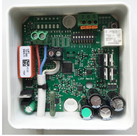
LIP7 TA (tandem) #121306