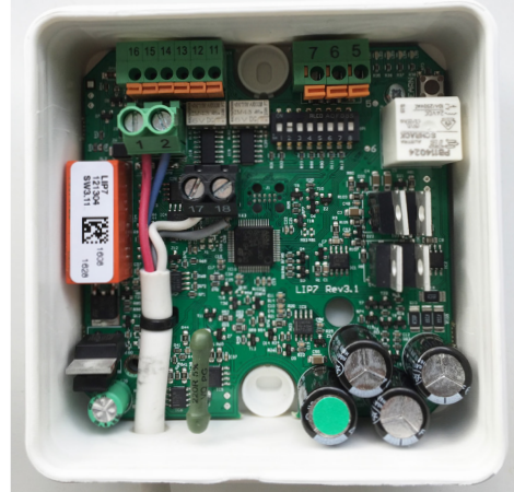
LIP7 OC (open / close) #121308