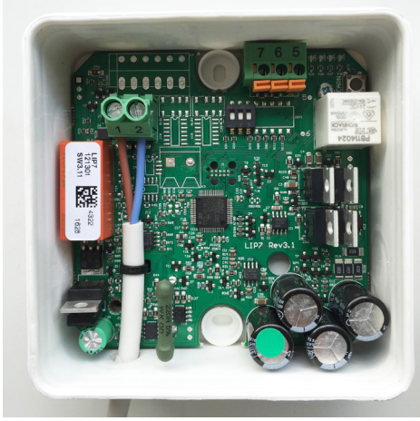
LIP7 BA (basis) #121305

intelligent and electronic current limiter