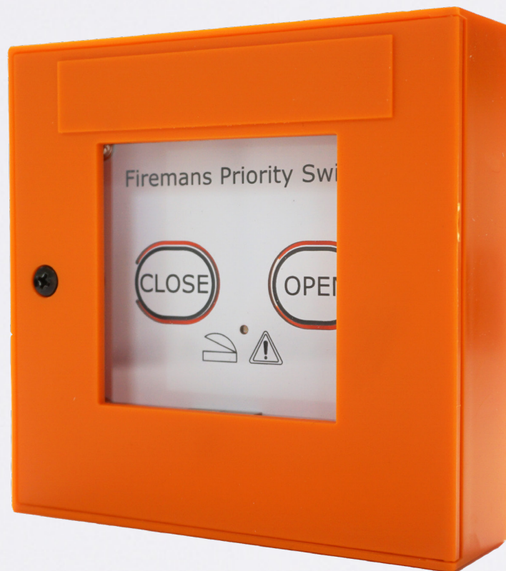
Firemans Priority Switch with Reset, IP40 for Actulux smoke ventilation systems